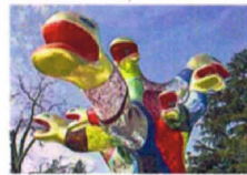
ON THE COVER The 18-foot "Snake Tree" at the Nassau County Museum of Art

Y ou expect to see artwork in a museum or gallery — but how about outdoors? Visit sculpture gardens on Long Island and you'll see striking works nestled in a grove of trees or peeking playfully out of a patch of tulips.