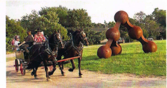
Horses draw a carriage past "Pyramid" in Water Mill.

MUST-SEES Popa's "Embrace of the Sun," which is a large orb surrounded by smaller ones that often is surrounded by grazing sheep; "Astronauts" involves 22-foot-tall figures that act as sentries, welcoming people into the sculpture fields.