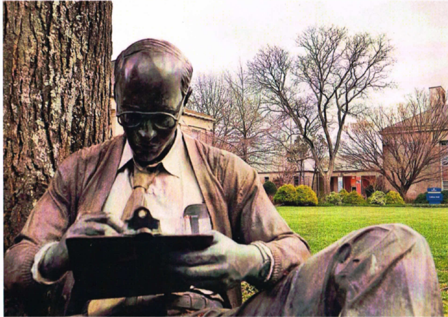
"Creating," created by J. Seward Johnson Jr., sits under a tree at Hofstra University.